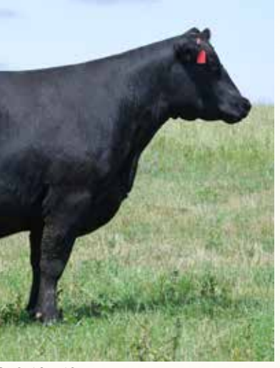
DTS 40 - 42

Lot 41-42: Another pair of 907G daughters and they are rips! The Beauty's absolutely never go out of style and lots 41 & 42 are evident why. If you love investing heavily into cow families like we do, then we highly recommend getting yourself a beauty. Both lots 41 & 42 has extra style n substance while remaining sharp in their lines. We really like this offering of open Angus heifers.