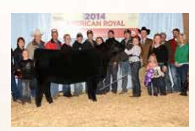
GREAT GRANDAM - 311A

WELSHS DEW IT RIGHT067T ES RIGHT TIME FA110-4 ES A110