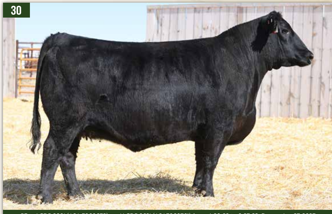
PE to LCDR 209J (ASA 3960632) and LCDR 262J (ASA3960761) from 4-20-22 to 6-27-22. Due on Jan 27, 2023

COLBURN PRIMO 5153 RUST MS BLKCAP MAY 805F S A V BLACKCAP MAY 6566