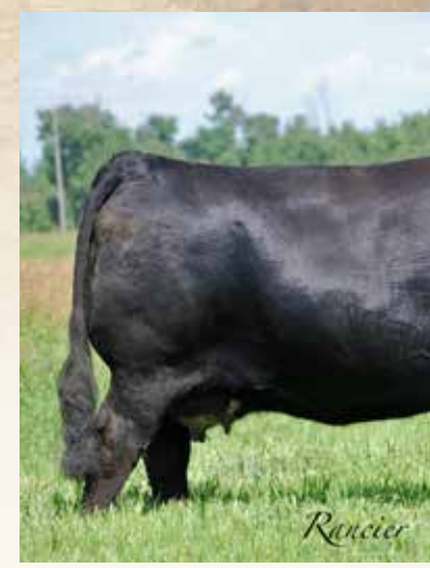
RF CERTAINLY FLIRTIN 2022

W/C FORT KNOX 609F W/C BET ON RED 481H W/C ANGEL 7113E WFL WESTCOTT 24C RF CERTAINLY FLIRTIN 740E RF CERTAINLY FLIRTIN 202Z