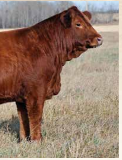
OTS 17 - 19