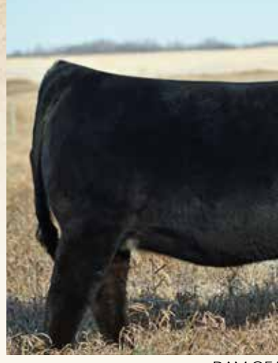
DAM OF I

SO REMEDY 7F B&K CREAM SODA 8D WS PROCLAMATION E202 RF FLIRT 021H RF FLIRT 8120F