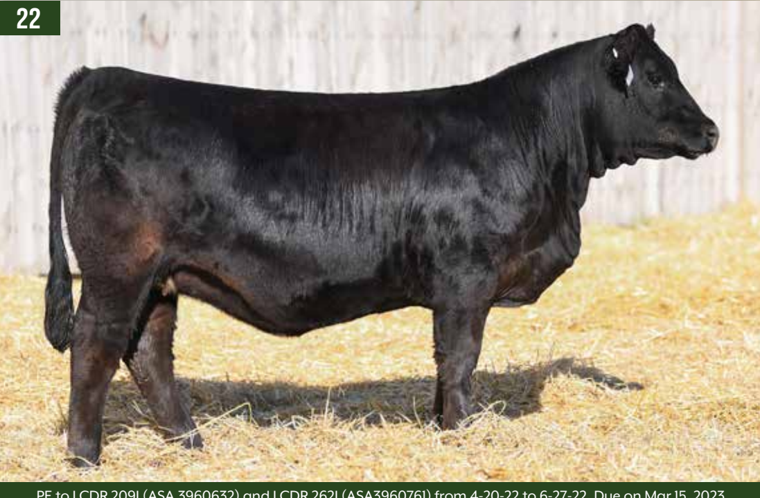
PE to LCDR 209J (ASA 3960632) and LCDR 262J (ASA3960761) from 4-20-22 to 6-27-22. Due on Mar 15, 2023