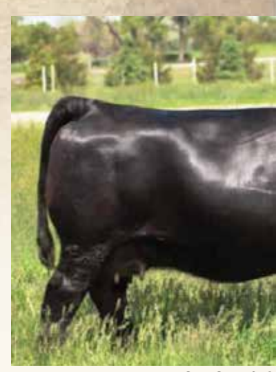
DAM OF LOT 7 & G