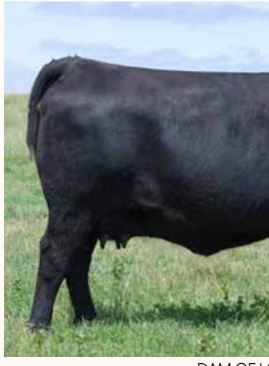
DAM OF LO

BROOKING FIREBRAND 6068 RUST FORGED OF FIRE 0412 BROOKING BEAUTY 8187 SAV RENOVATION 6822 RUST MS BEAUTY 907G BROOKING BEAUTY 6066