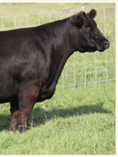
DTS 47 - 49

BROOKING BANK NOTE 4040 BROOKING FIREBRAND 6068 BROOKING ANNIE K 390