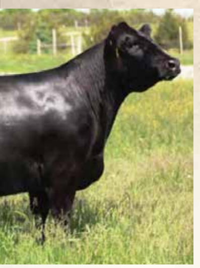
RANDAM OF LOT 9

WC BANKROLL 811D W/C BANK ON IT 273H KS MISS SEQUOIA Y770 RUBY`S CURRENCY 7134E RUST MS KHLOE 9155G MISS WERNING KP 8543U