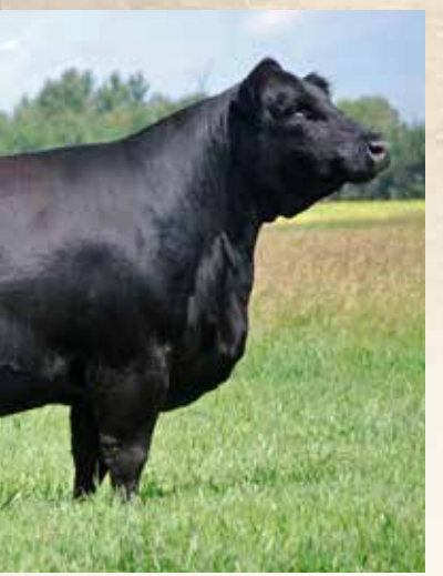
GRANDAM OF LOTS 17-21

WLB BOUNTY HUNTER 365C CROSSROAD BLACK BOUNTY 13F CROSSROAD DIVA 425D