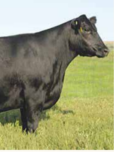
FLOTS 45 - 46

conley Sandy 8355 SAV PRESIDENT 6847 SAV MADAME PRIDE 9832 SAV MADAME PRIDE 3045