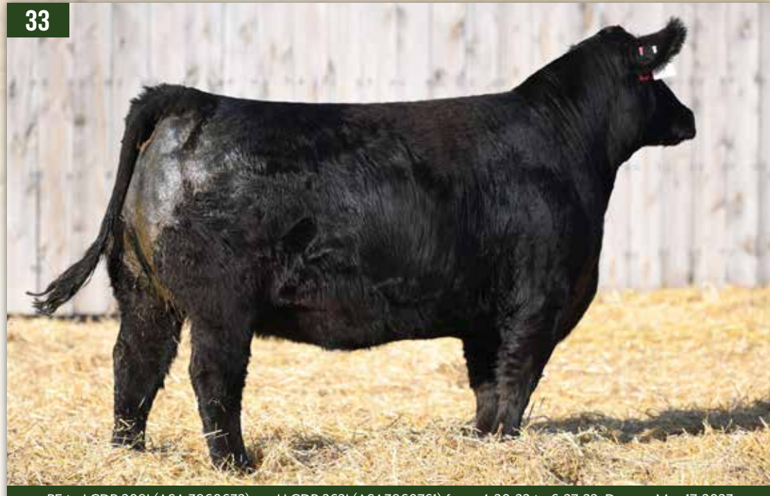
PE to LCDR 209J (ASA 3960632) and LCDR 262J (ASA3960761) from 4-20-22 to 6-27-22. Due on Mar 17, 2023

VCL LKC PROFIT MAKER 604D RUST MS UNITED DREAM 818F W/C RJ MISS 8543 6114D