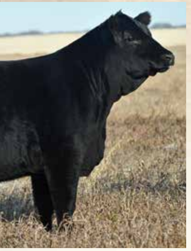
OTS 3 - 5

SUPP W/C NIGHT WATCH 84E RUST PRIMETIME 507G HARRELL ANGEL 5870C GLOW WS PROCLAMATION E202 RF FLIRT 021H RF FLIRT 8120F