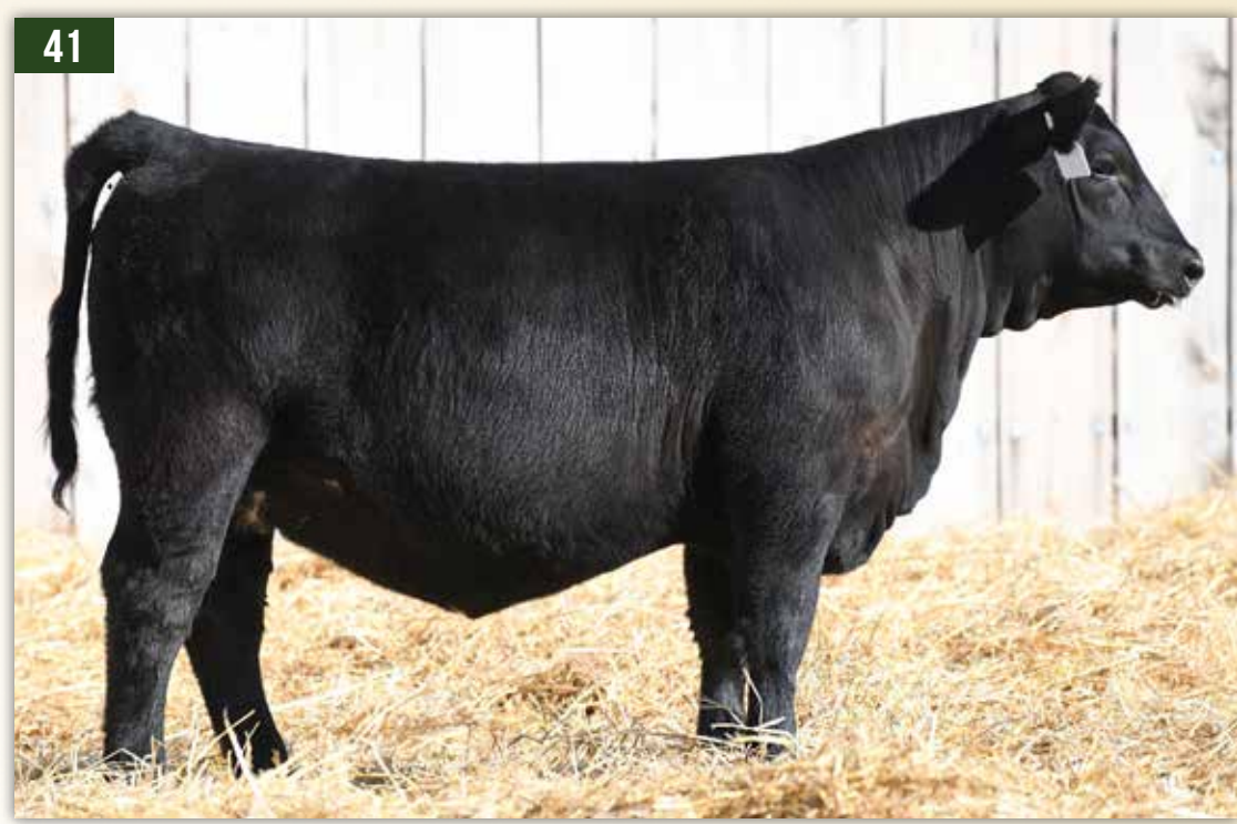
RUST MS Beauty 2031K 20425629 - MAR 4, 2022 ANGUS | BW 88 | Adj. WW 715 BW WW YW MWT Milk YHT MMT CWT MRB

SIPP BALDRIDGE DONE DEAL VAR ARIBITRATOR 076 VAR BRISTOW EVELYN 410 GLIPP SAV RENOVATION 6822 RUST MS BEAUTY 907G BROOKING BEAUTY 6066