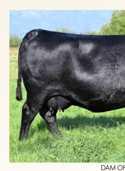
BROOKING FIREBRAND 6068 RUST FORGED OF FIRE 0412 BROOKING BEAUTY 8187 S A V RENOWN 3439 LAWSONS CHLOE C815 LAWSONS CHLOE Z341

RUST Ms Chive 2034K 9 PENDING - MAR 8, 2022 ANGUS | BW 94 | Adj. WW 855 CE BW WW YW MCE Milk MWW CWT MF