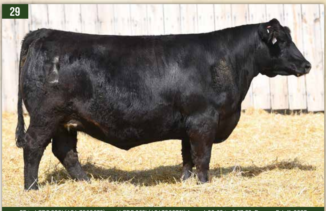
PE to LCDR 209J (ASA 3960632) and LCDR 262J (ASA3960761) from 4-20-22 to 6-27-22. Due on Feb 11, 2023

W/C HUSKER 838C RUST MS BLACKBIRD 8125F KAF MISS BLACKBIRD526-219