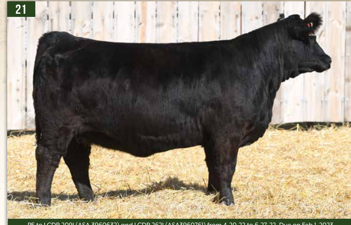
PE to LCDR 209J (ASA 3960632) and LCDR 262J (ASA3960761) from 4-20-22 to 6-27-22. Due on Feb 1, 2023

RF CAPACITY 742E CERTAINLY FLIRTIN 970G RF CERTAINLY FLIRTIN 202Z