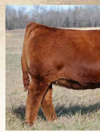
DAM OF L